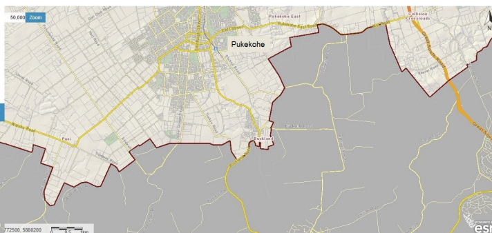
Above: The map shows detail of the boundary between Auckland City and Waikato Regional Authority. The towns of Waiuku and Pukekohe are in Auckland, but much of the farm land between these and the river is Waikato.