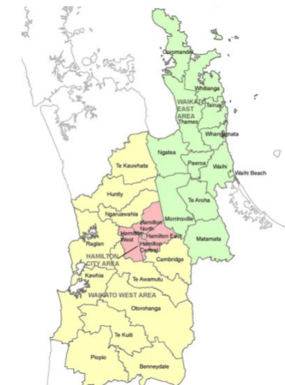
Left: Waikato Police District

And when it comes to COVID-19 lock downs it has turned out that the boundary of Auckland with Waikato gets extended southward so as not to leave a large chunk of the local Waikato countryside isolated through lack of access to the Tuakau bridge.